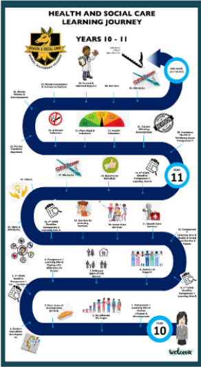
SWA Health & Social Care

Click on the image for the Health & Social Care Learning Journey.