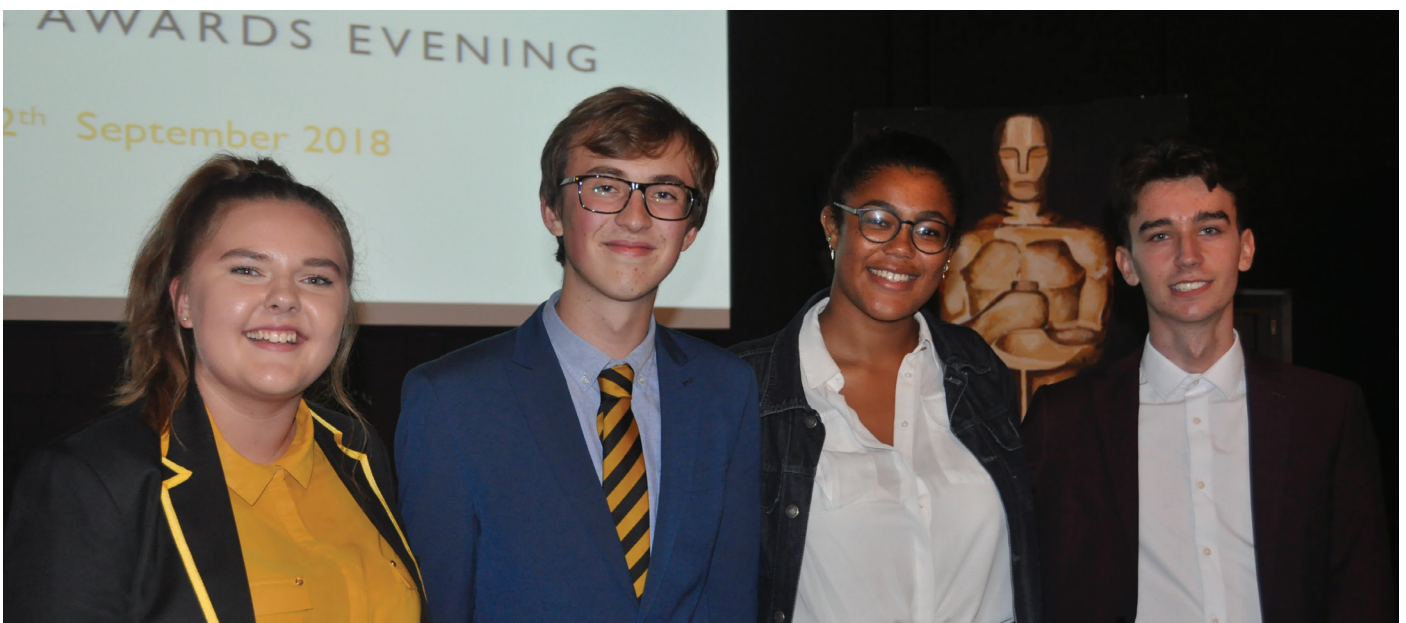
Previous Head Boys and Girls

Deputy, Head Boy and Girl positions, student council and prefects – the school is what you make it to be – these are positions of responsibility that make real changes for the better for the whole school. As well as these, there are also roles as house captains and leaders for a number of roles such as charities rep, sports rep and so on. There are also additional roles such as ambassadors for Students as Researchers, Students as Interviewers, Peer Support and College Council. As with all other forms of Enrichment, these positions of responsibility are meant to be for your enjoyment and not a chore and will further help to make any application of yours stand out from the crowd just that little bit more, quite apart from making a real difference to the way that the school's future develops.