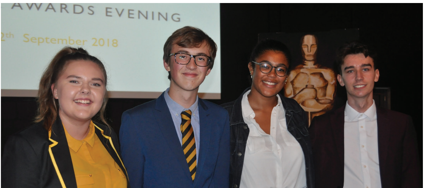
Previous Head Boys and Girls

Deputy, Head Boy and Girl positions, student council and prefects – the school is what you make it to be – these are positions of responsibility that make real changes for the better for the whole school. As well as these, there are also roles as house captains and leaders for a number of roles such as charities rep, sports rep and so on. There are also additional roles such as ambassadors for Students as Researchers, Students as Interviewers, Peer Support and College Council. As with all other forms of Enrichment, these positions of responsibility are meant to be for your enjoyment and not a chore and will further help to make any application of yours stand out from the crowd just that little bit more, quite apart from making a real difference to the way that the school's future develops.