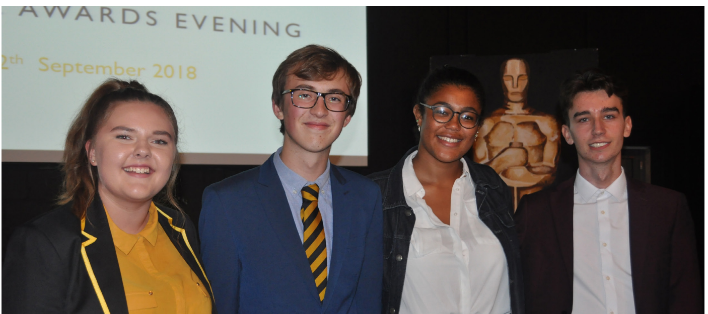
Previous Head Boys and Girls

Deputy, Head Boy and Girl positions, student council and prefects – the school is what you make it to be – these are positions of responsibility that make real changes for the better for the whole school. As well as these, there are also roles as house captains and leaders for a number of roles such as charities rep, sports rep and so on. There are also additional roles such as ambassadors for Students as Researchers, Students as Interviewers, Peer Support and College Council. As with all other forms of Enrichment, these positions of responsibility are meant to be for your enjoyment and not a chore and will further help to make any application of yours stand out from the crowd just that little bit more, quite apart from making a real difference to the way that the school's future develops.