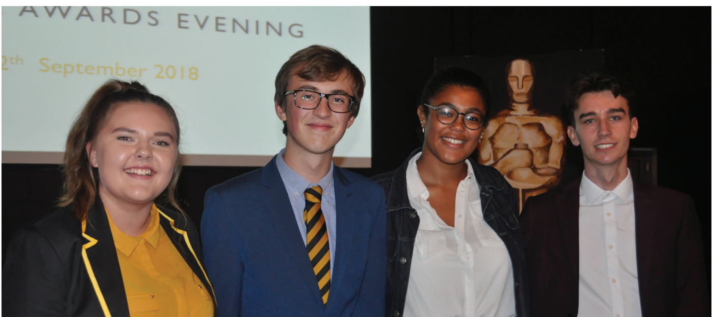
Previous Head Boys and Girls

Deputy, Head Boy and Girl positions, student council and prefects – the school is what you make it to be – these are positions of responsibility that make real changes for the better for the whole school. As well as these, there are also roles as house captains and leaders for a number of roles such as charities rep, sports rep and so on. There are also additional roles such as ambassadors for Students as Researchers, Students as Interviewers, Peer Support and College Council. As with all other forms of Enrichment, these positions of responsibility are meant to be for your enjoyment and not a chore and will further help to make any application of yours stand out from the crowd just that little bit more, quite apart from making a real difference to the way that the school's future develops.